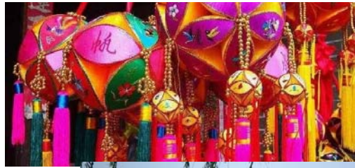
Nanning, School, Nanhu, Qingxiu, Folk Festival and lots more