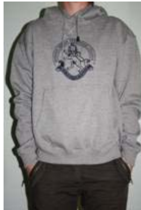
2010 New Design