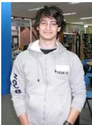
2009 Yr 12 Hoodie

YR 12 KEEP AN EYE OUT FOR POLLS THIS WEEK TO DECIDE ON ZIP UP HOODIES, OR THE NEW DESIGN. MAJORITY VOTE WILL WIN!!